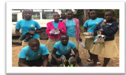
Getting New Shoes

Living Hope High School is run only by donations and sponsorship by people with loving and giving hearts. Each new student shares their stories then prays and waits to be sponsored. They are sponsored by individuals, churches, youth groups or women's groups. It takes many hands together and funds to run a school with this many students and we praise the Lord for his goodness and caring love! Students needing sponsorship are listed on website.