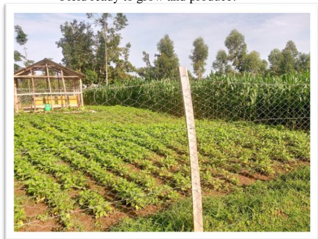
The rains came the bamboo and crops are growing