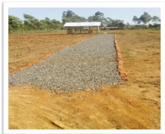
Path to Bee Garden