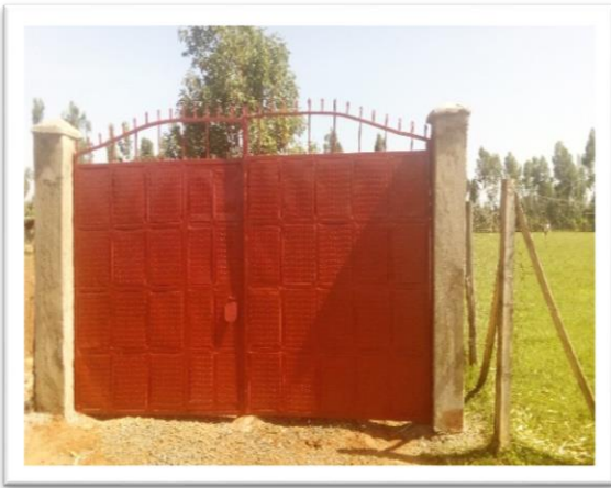
The Gate got a new paint job!