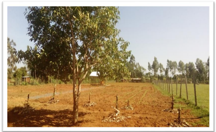
Field ready to grow and produce!