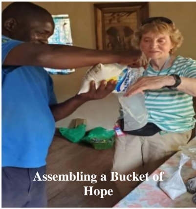
Assembling a Bucket of Hope