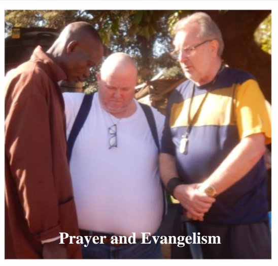
Prayer and Evangelism