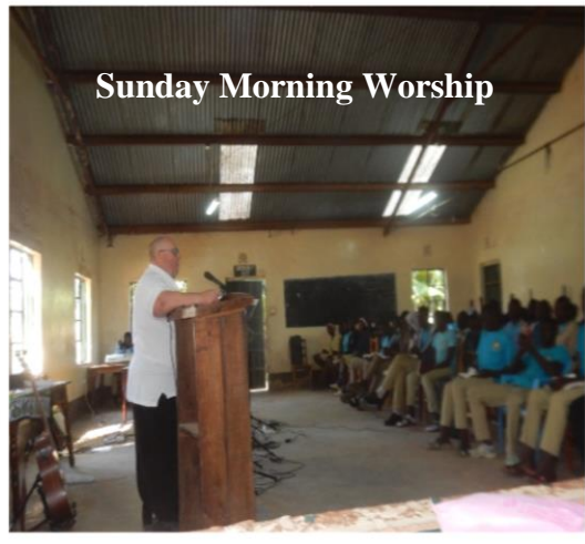
Sunday Morning Worship