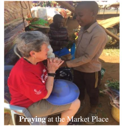
Praying at the Market Place