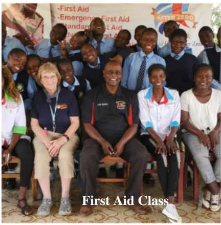
First Aid Class