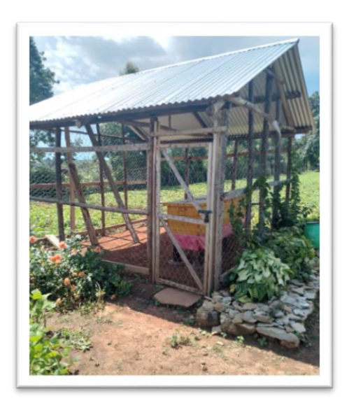
A big Thank-you to all who donated to make this garden and bee program a reality!